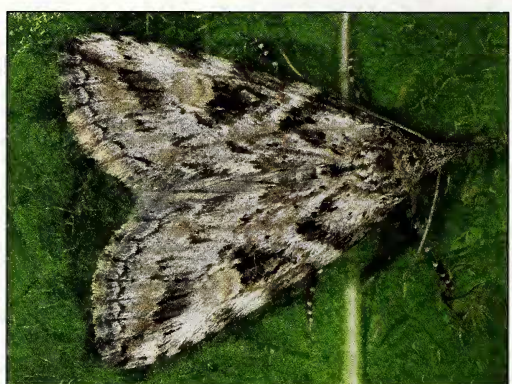
Fig. 17. Pupa of Abrostola canariensis (cocoon re- Fig. 18. Adult female of Rhynchina canariensis, ex larva, Vallehermoso, December 2011.

to Noctuidae in the old sense such as Hypeninae and Catocalinae is reflected by their placement in the newly established family Erebidae (cf. Lafontaine & Fibiger 2006; Zahiri et al. 2011).